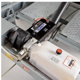
Electric Hydraulic Tip