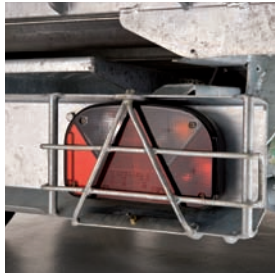
Rear Light Guards