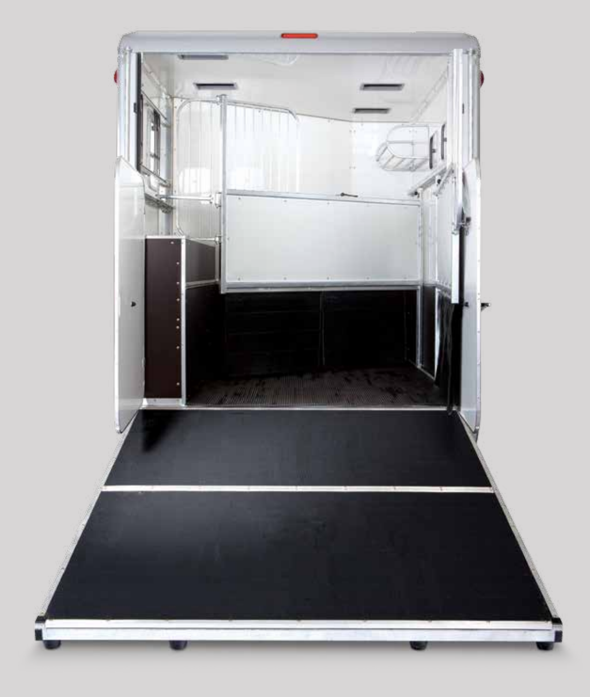
Eventa M with optional rug rack