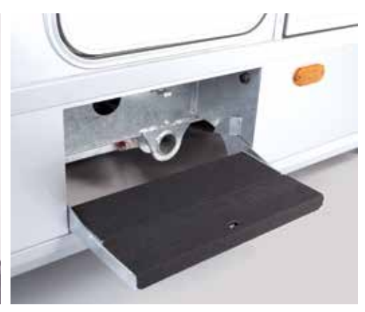
Step into Living

Flush fitting locking mechanism, provides privacy for riders and their families. The insulated split door allows the top to be open when using the hob or for a breeze on a warm day and features a double glazed window with integrated blind.