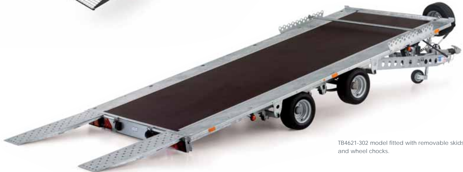
TB4621-302 model fitted with removable skids and wheel chocks.