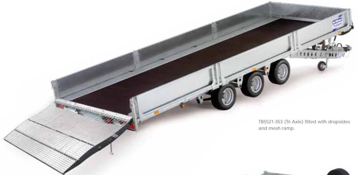
TB5521-353 (Tri Axle) fitted with dropsides and mesh ramp.

The TB range of trailers is not recommended for loading indoor Access Platforms. Please refer to the GH Plant Brochure for trailers to suit.